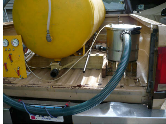
Super Sucker Detail

them to you. It really works well. In fact so good that we have not had to pick up a single barrel so far this winter. We do