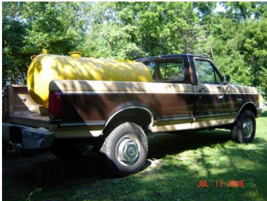
The “Super Sucker” YBDC’s new collection vehicle

After a long search for a good used tank and then a vehicle to carry it, the whole thing is beginning to shape up. We found a used LP tank which turned out to have some propane left in it. So it was carefully washed and rinsed several times and finally made safe to cut into and weld. Merrill Hamilton has done the welding of a new primary shut-off on the top and input and outlet ports on the bottom. It will be plumbed with two inch pipe to reduce flow resistance. Several members spent part of a Saturday getting it hoisted onto the truck (tank weighs 560 pounds) and ready to bolt down. Once finished we will have the ability to suck used oil into the truck tank by vacuum instead of through a pump. A large screen is planned in the input line so that we will get much cleaner oil than we have in the past.