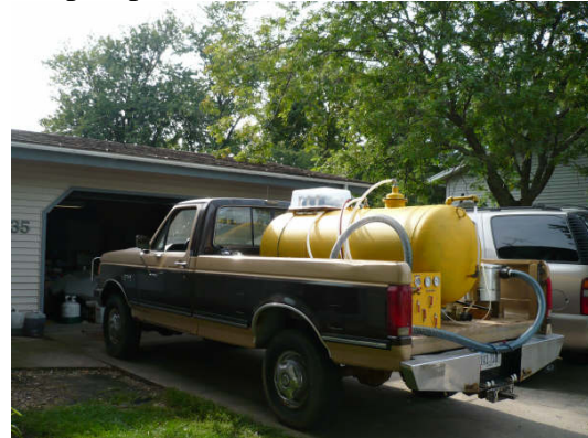
Super Sucker Detail

have to heat some of the oil with a 1000 watt heater to get it liquid enough to pull which does take a little time but we don't have hassle of loading unloading barrels in the winter. After we pull the oil we just take the truck back to the farm and we pump it out into 250 or 350 gallon