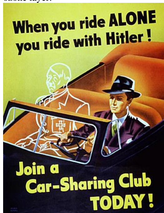
by Weimer Pursell, 1943

number would help too (and would be simple on a well run web site). Our leaders speaking to businesses and organizations to encourage flexible work times would help. Imagine if a region, state or nation ran ads encouraging people to make a new friend and cut the costs of energy for everyone at the same time! Solutions to our energy problems are there if we will look for them. We landed on the moon, conquered small pox and shrank the hole in the Earth's ozone layer.