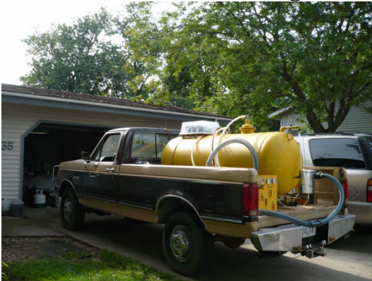
Super Sucker Detail

Thought I'd drop you a line and send some pictures along of the super sucker that Don built along with assistance from Merrill with the welding. I Helped Don pick up the used propane tank and